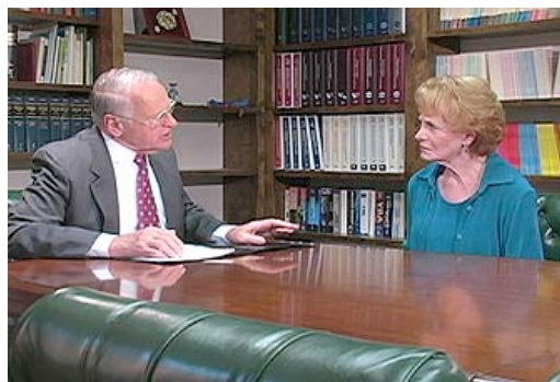
This scene in our Club's 2007 movie "Dearly Departed"

Now arrange the circled letters to form the surprise answer, as suggested by the photo