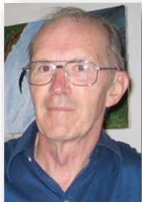
My Two Cents

It's a New Year and I, your new penny V.P., have a chance to put my two cents in front of you each month. Well let's start out at a couple of obvious problems that Viewfinders has grown into. Then we have the rest of the year for you to disagree with me or to work on solving these problems. You know the old saying; "If you get lemons, make lemonade!"